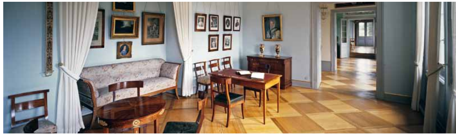
👑 A Biedermeier-style idyll: Duchess Henriette's living room

Construction began in 1538 at the orders of Duke Ulrich von Württemberg, as one of seven major strongholds around Stuttgart. The building was completed in 1556 under Duke Christoph von Württemberg. The roughly diamond-shaped palace is surrounded by a deep dry moat.