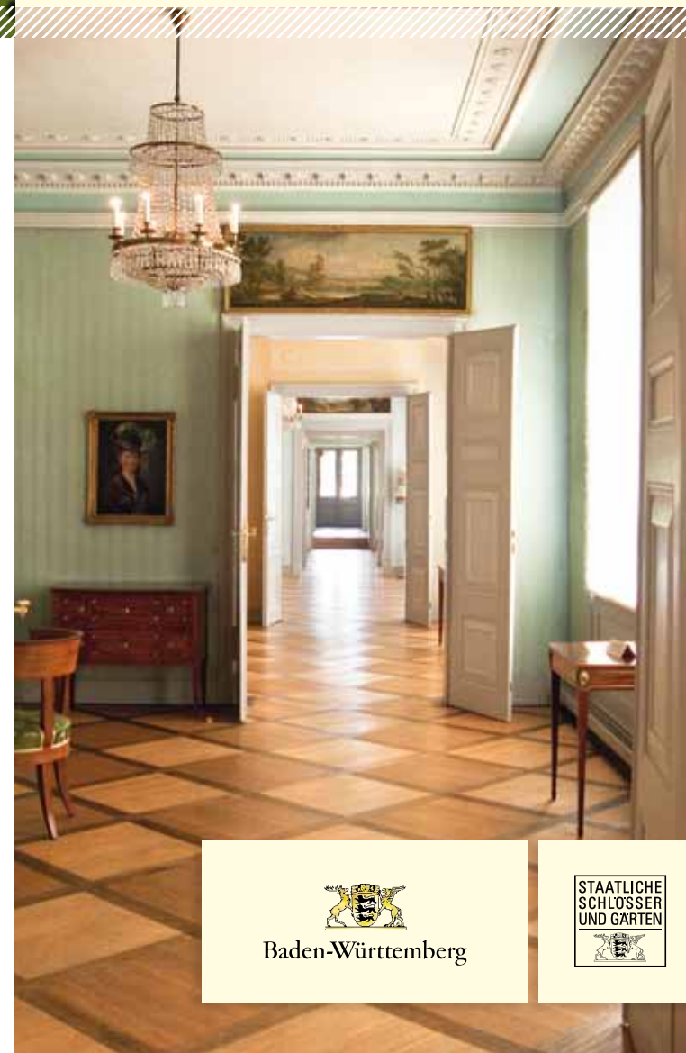
concept and design: www.jungkommunikation.de