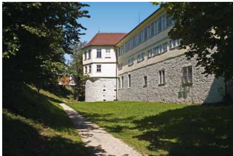
👑 After being widowed, Duchess Henriette lived here for 40 years